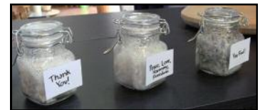
Day 70 (May 8 2013)