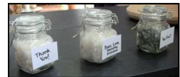
Day 74 (May 12 2013)