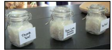
Day 3 (March 3 2013)

Maybe one day, we as a whole, will be ready to accept this ‘invisible’ energy, e.g. power of the thoughts as a reality. I think if this is done, then it would clarify matters in many respects and bring much progress because if this ‘invisible’ energy really exists, it can be traced back to be the source of much of the devastating effects that we are facing in our times, e.g. criminality, unjustified wars, financial crisis, unpeace, disharmony, etc. And conversely, it can be utilised for much progress in the most diverse areas.