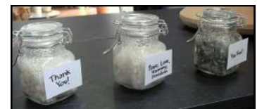
Day 73 (May 11 2013)