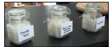
Day 47 (April 15 2013)