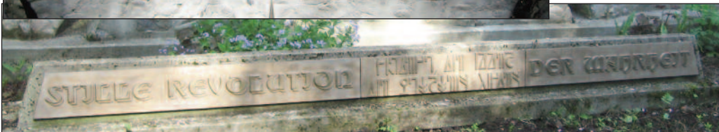
DETAILS OF MONUMENT ON SSSC GROUNDS