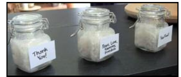
Day 32 (April 1 2013)