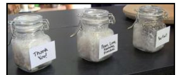
Day 67 (May 5 2013)