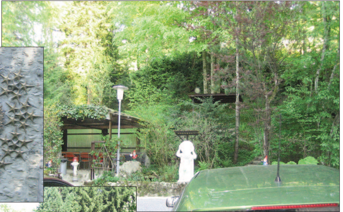
SSSC VIEW FROM PARKING AREA