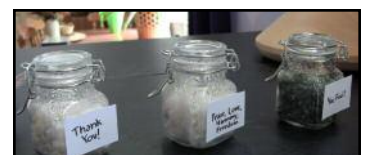
Day 89 (May 27 2013)